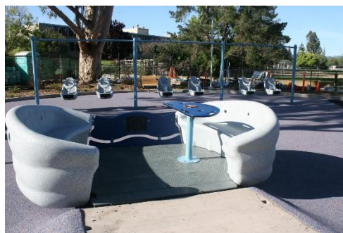
Magical Bridge Playground-Mitchel Park

Simple and Intuitive Use: The equipment that children can play together must be suitable for every child's use. The recommended ways to reach the equipment should not be discriminating. When a child needs to reach the equipment by ramp, a system should be considered so that the other child cannot easily ascend over the other. Either the only option to reach the equipment is a fun and unobtrusively designed ramp, or the height problem must be eliminated directly.