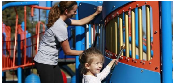
Katy Park in Chanute, Kansas

The sensory garden, which allows children to develop their imagination, especially visually impaired children to recognize objects by touch, is placed at a height that can be used comfortably by wheelchair users. Thus, children of all abilities can play.