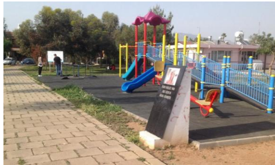
Dr fazıl Kucuk Pak

The park area is easily accessible with ramps and moving around in the park and accessing to the equipment is easily provided. There are accessibility playgrounds in the park, which makes it possible for children of all ability to play comfortably. This can be considered positive.