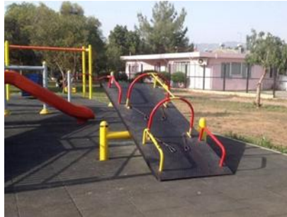
Dr fazıl Kucuk Park

The teeter-totter equipment in accessible playgrounds are suitable for two children with wheel-chair to go up and enjoy. The straps on the equipment prevent the wheelchair from slipping away, but even if there is not an adult around to help them wear these straps, the children can easily secure themselves by holding on to the handholds. It is fully suited to the principle of size and space for approach and use. Since the toy is suitable only for wheelchair users, it is in contradiction to inclusive playground logic.