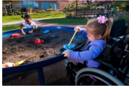
Signal Centers Therapeutic Playground for the Arts – Chattanooga

Tolerance for Error: The materials to be used in the playgrounds are very important. At the same time, it may be appropriate to use hard rubber material that will not harm the child falling down, and will allow the child using the wheelchair to move comfortably. Children love climbing high altitudes, we should be careful about their safety especially when we are designing compelling equipment for children, such as climbing walls. We have to use elements like rope that children can hold on while climbing. If they will be climbing with a net, we have to make sure that the openings on the net are no more than 11 cm, so that the child does not fall through these openings.