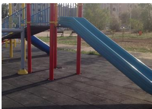
Dr fazıl Kucuk Park

There is a cobble stone and grass area on the park circulation space and a rubber surface on the playground floor where children will not be harmed if they fall from equipment and the wheelchair can easily move around. Tolerance for error principle is provided on the ground.