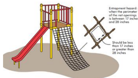
Public Playground Safety Handbook

Tolerance for Error: The materials to be used in the playgrounds are very important. At the same time, it may be appropriate to use hard rubber material that will not harm the child falling down, and will allow the child using the wheelchair to move comfortably. Children love climbing high altitudes, we should be careful about their safety especially when we are designing compelling equipment for children, such as climbing walls. We have to use elements like rope that children can hold on while climbing. If they will be climbing with a net, we have to make sure that the openings on the net are no more than 11 cm, so that the child does not fall through these openings.