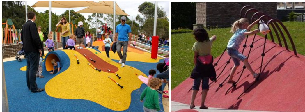
Livvi's Place – Five Dock, New South Wales, Australia

Low Physical Effort: The toys used for the child's physical development should not force or discourage the child too much. Choosing the right measurements for their age and ability can help in their success and gives them confidence to use other equipment. Extra handles allow the child to feel more secure.