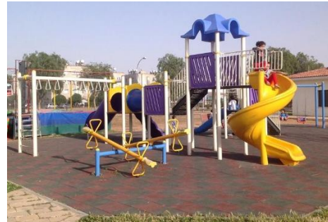
Dr fazıl Kucuk Pak

The Accesibility playground is located on a different, remote side, despite the empty spaces next to the other two playgrounds, and is stigmatised as a playground for children of different development, which violates the Equitable principle entirely and is totally in contradiction to the inclusive playground logic.