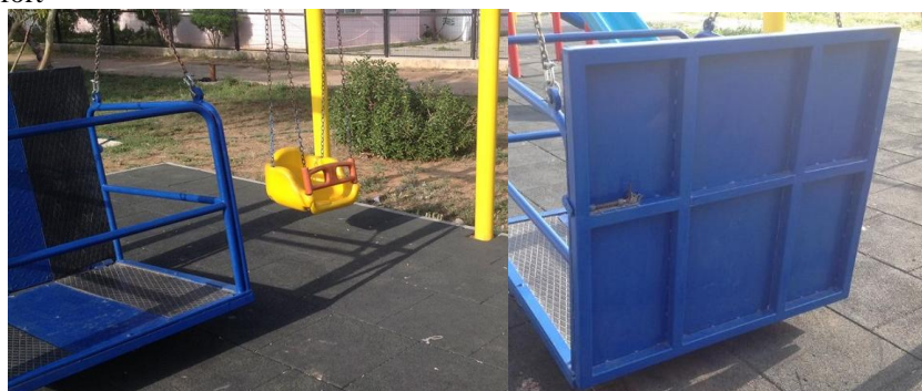
Dr fazıl Kucuk Park

This swing with a mounted ramp is suitable for accessibility playgrounds, but heavy Iron Gate and door handle are not suitable for a child to lower the ramp by themselves. These swings, which are likely to hit other children while swinging due to the iron and heavy structure, are recommended by the U.S. Consumer Products Safety