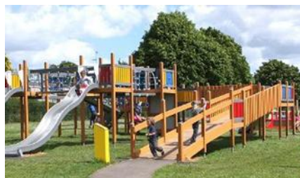
A Dream Come True – Harrisonburg, Virginia

Equitable Use: The route of access to the playground must be the same for the social and physical participation of every child of different abilities. The floor of the entire circulation area in the playground should be at the same height or soft ramps should be used. Designs intended for children using ancillary equipment such as wheelchairs should not be distant from the equipment used by other children and they should not be distant from roads.