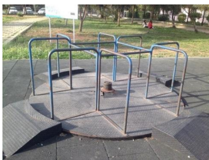
Dr fazıl Kucuk Park - Credit: Bugu Sah

In accessible playground, there is Mary Go Round, which is considered as a socializing equipment and children like very much. The equipment is addressed to four wheelchair users and there are four ramps and it is a good example to use in the accessibility playground. On the other hand, there would be no need for ramp if the play equipment was buried on the floor, and the children would not feel that they need the ramp. It is important to keep the equipment in the socializing parks on the same level with the ground.