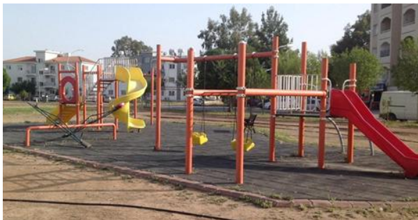
Dr fazıl Kucuk Pak

The park area is easily accessible with ramps and moving around in the park and accessing to the equipment is easily provided. There are accessibility playgrounds in the park, which makes it possible for children of all ability to play comfortably. This can be considered positive.