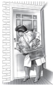
Accessible environment-towards universal design

Low Physical Effort : The design can be used efficiently and comfortably and with a minimum of fatigue. We use elements that will reduce the physical effort of the user. For example; doors of public areas must be sensor doors and the single doors shall have handles to make them easily operable.