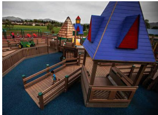
Brooklyn's Playground – Pocatello, Idaho

Flexibility in Use: Children must have multiple facilities to reach high platform equipment, and one of these facilities should be ramps with 4% slope.