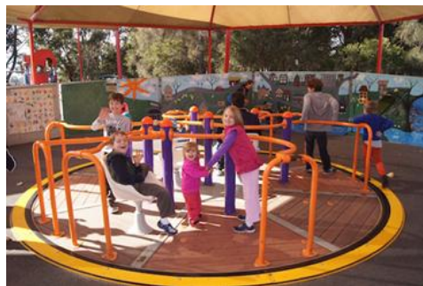
Timbrell Park- Australia

Size and Space for Approach and Use: Passages for wheelchair users and especially ramp heights should have accurate measurements. Suitable depths should be used for the child standing and sitting. Passages should allow the parents to have access to their children when they are in need. Equipment that is intended for use by many children is the most effective way for the children to socialize. This equipment should have sufficient space for at least 2 children using wheelchairs.