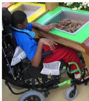
Carter School sensory garden- Boston

Improving the imagination: Equipment or areas designed specifically to enhance the imagination of children with visual and hearing impairment should be designed. Sensory wall for visually impaired children, and vibratory equipment for children with hearing impairment should be designed. [9]