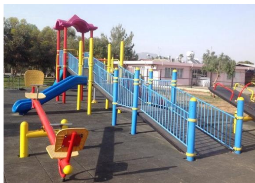
Dr fazıl Kucuk Park

Though, in order to reach elevated platforms designed for children who like to go up on high platforms, choosing ramps with %5 incline that can be used by more people compared to the stairs is in accordance with the principle of flexibility use, platform width is not suitable for a child using a wheelchair to maneuver.